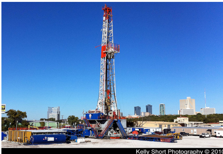
Unconventional shale gas platform located just outside Fort Worth, Texas.

States and the BLM are expending valuable resources issuing hydraulic fracturing disclosure requirements. Companies are spending valuable time submitting disclosures. We should make sure these systems work.